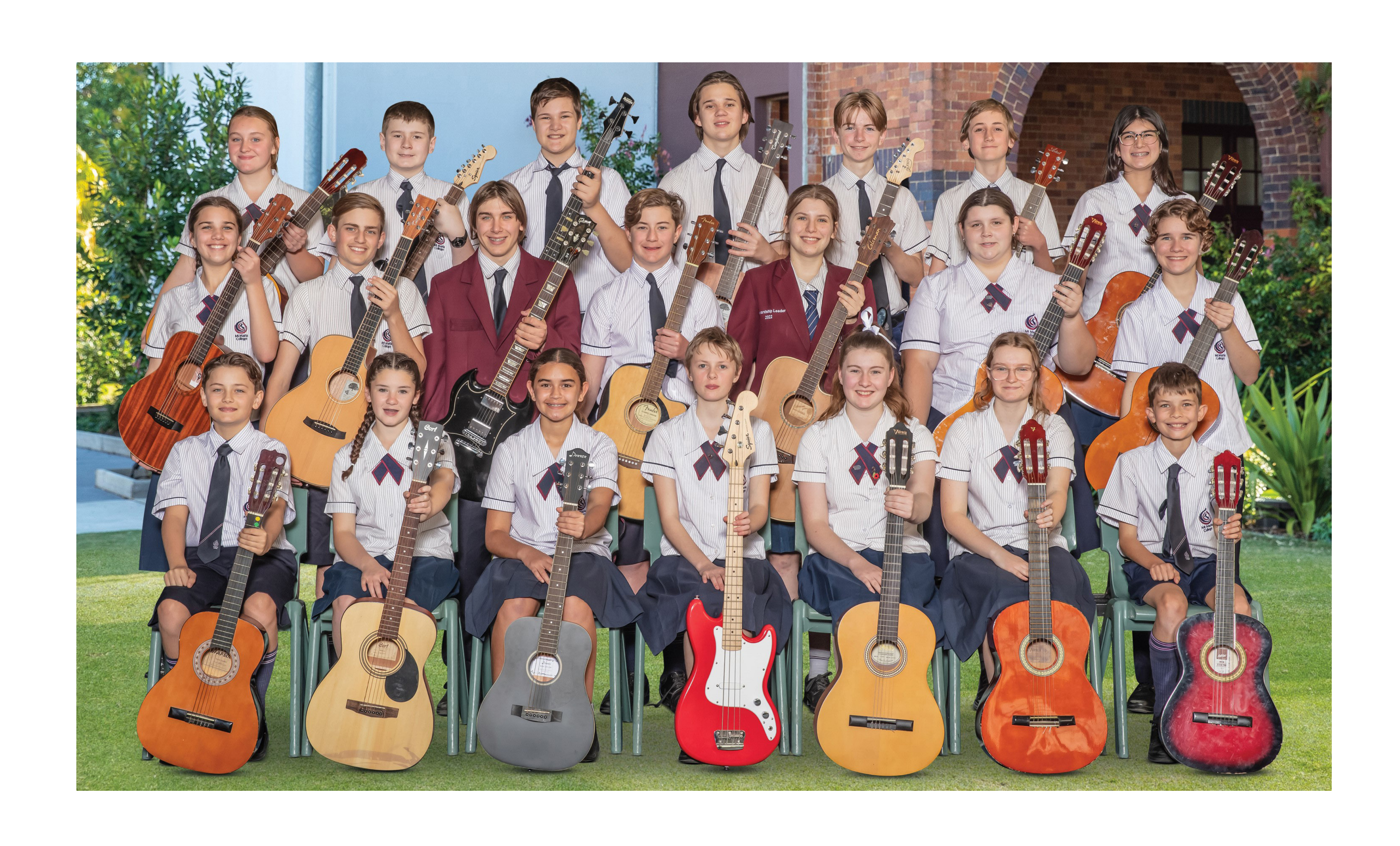
A guide for parents and students